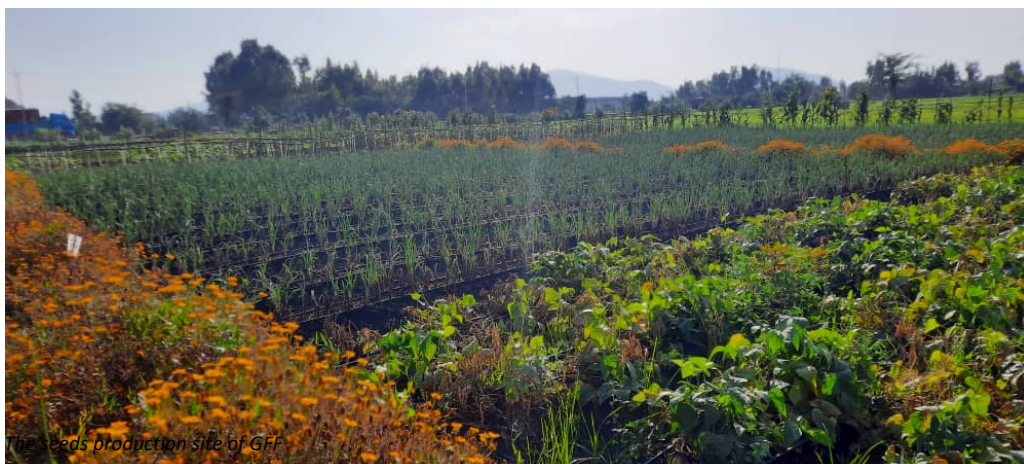
The seeds production site of GFF

As we faced a serious issue, lacking access to organic seeds in Ethiopia, we decided at the beginning of 2021, to establish our own bank of seeds.