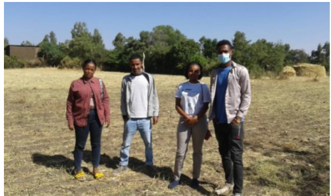
Ethio Organic Farming visiting a land.

As access to finance (loans) is very limited in Ethiopia and especially for young entrepreneurs, GFF decided to offer financial support in the form of a grant for each business. With this grant, the HUB members can rent land, purchase the necessary equipment and launch their business.